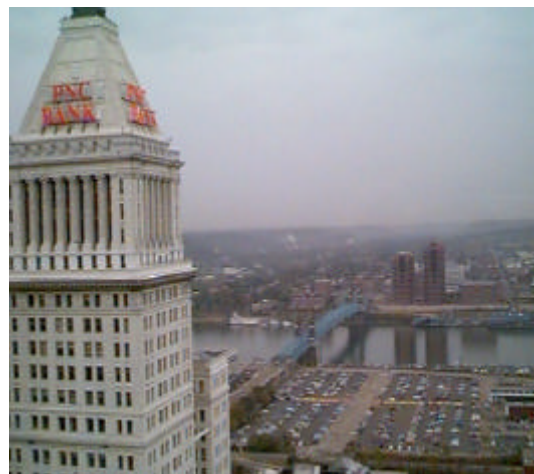
Cincinnati Riverscape from Scene of ORALL Annual Meeting, October 1997