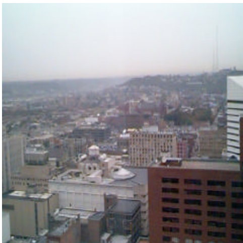
Cincinnati Cityscape from Scene of ORALL Annual Meeting, October 1997