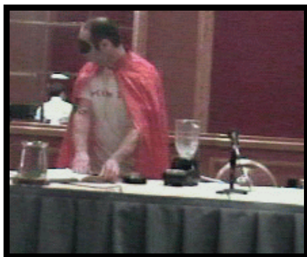
KeyCiteMan to the rescue, with a blender!?! It must have been Friday.